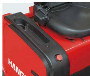
Cup holder, tool box